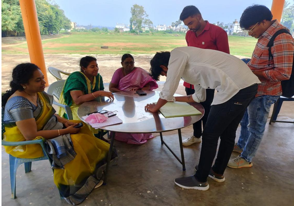
Reception for job drive