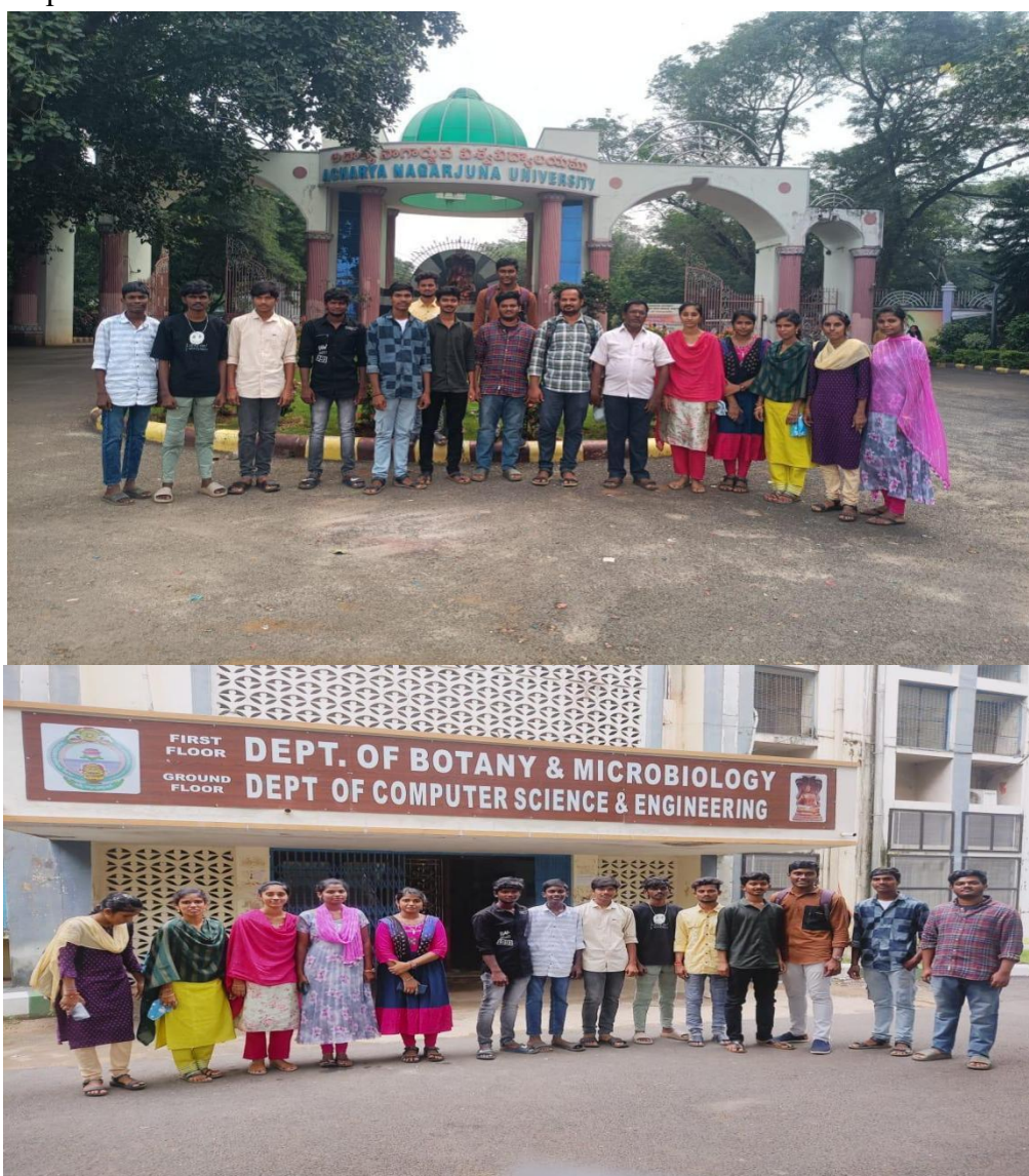
Students in the ANU campus

During the visit, students explored the university's Central Library and various science laboratories, gaining valuable insights into the academic resources and research facilities available at the institution. The tour provided students with a closer look at the advanced equipment and resources in the fields of physics, mathematics, and other sciences, enriching their academic experience.