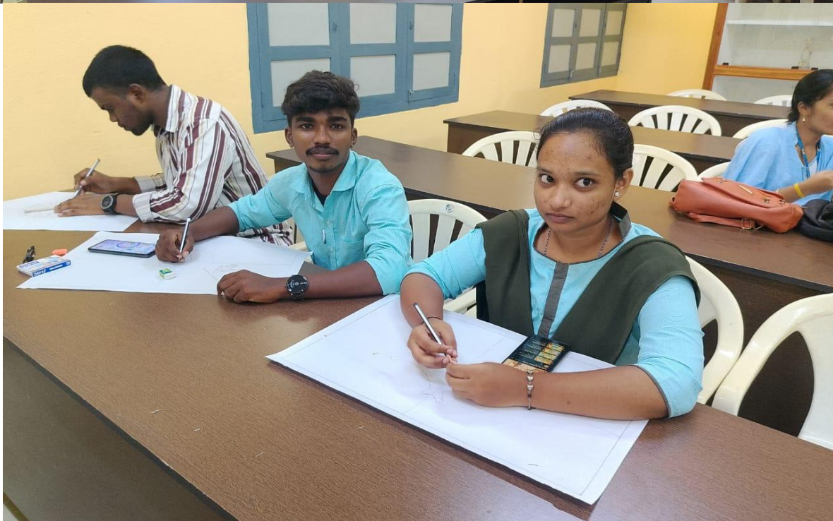
Students in Essay competition