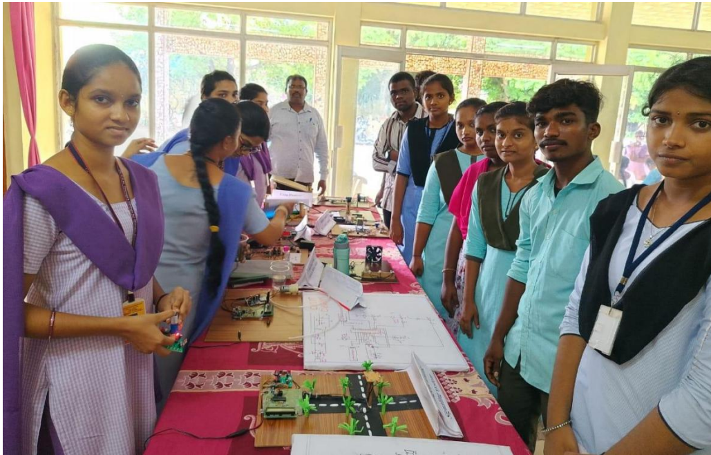
Participants in the events

The district youth festival proved to be a memorable and enriching experience, reflecting the institution's commitment to holistic student development.