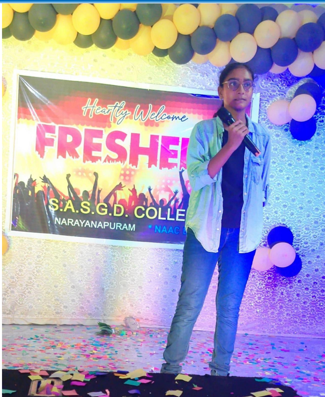
Opening lines of the student representative