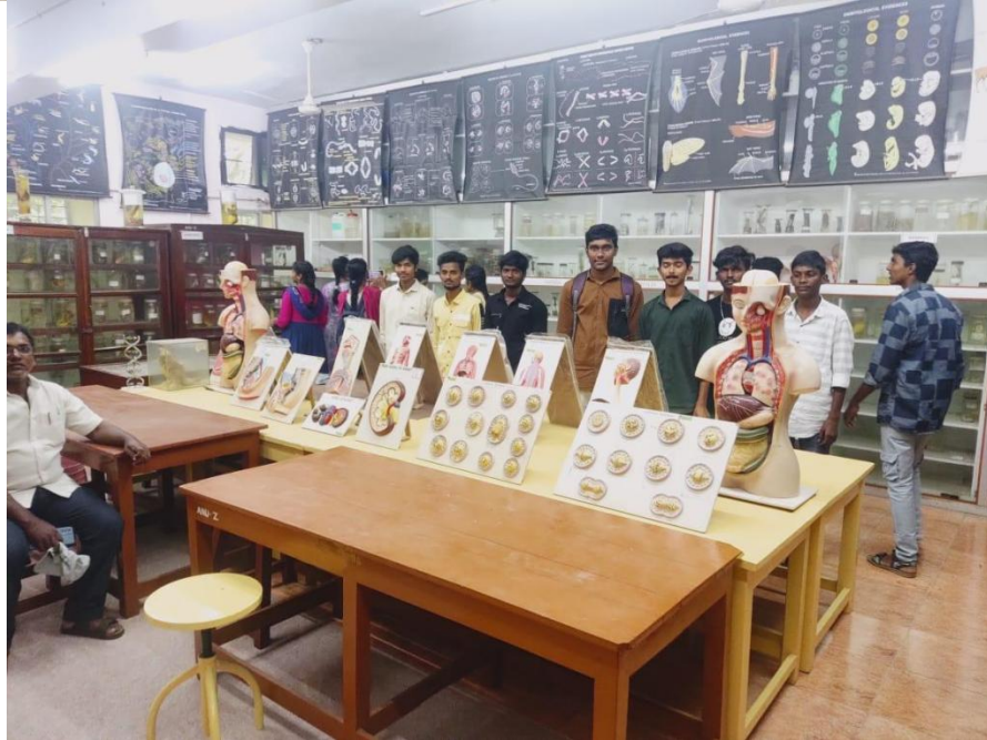
Labs in the campus