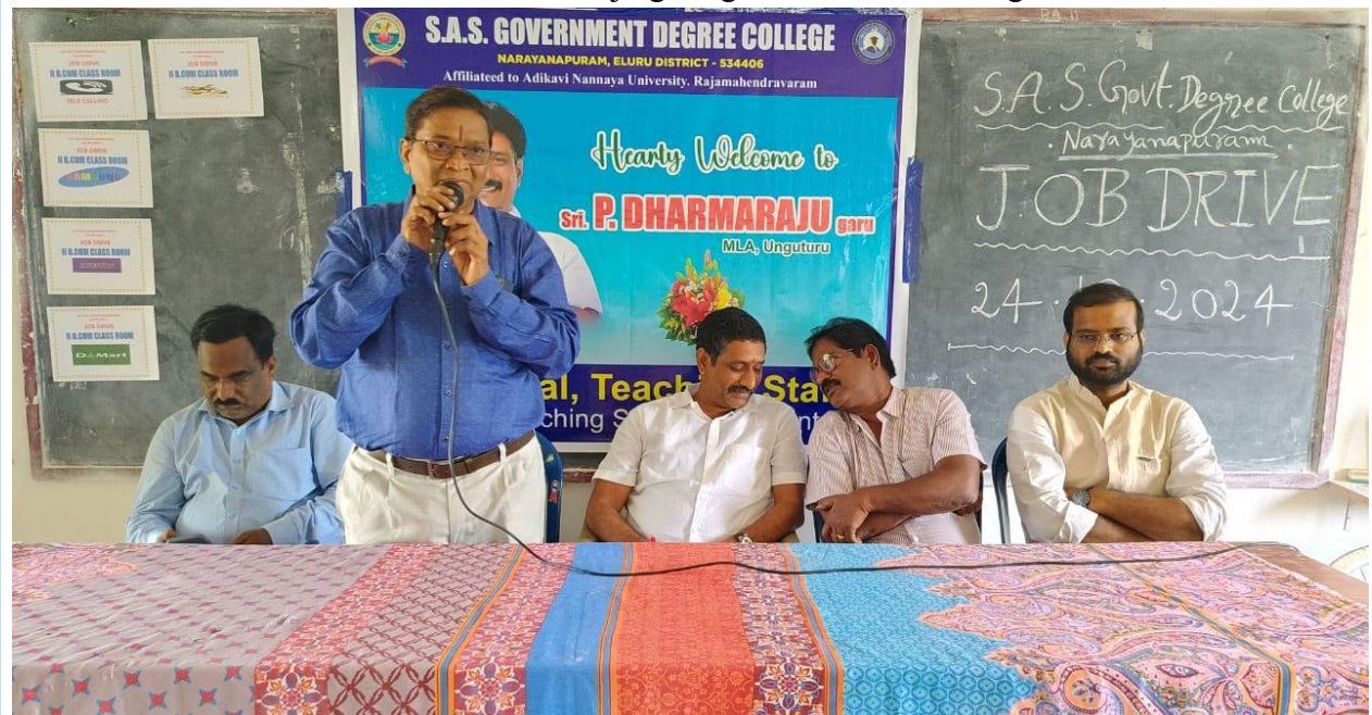
Opening remarks of the Principal