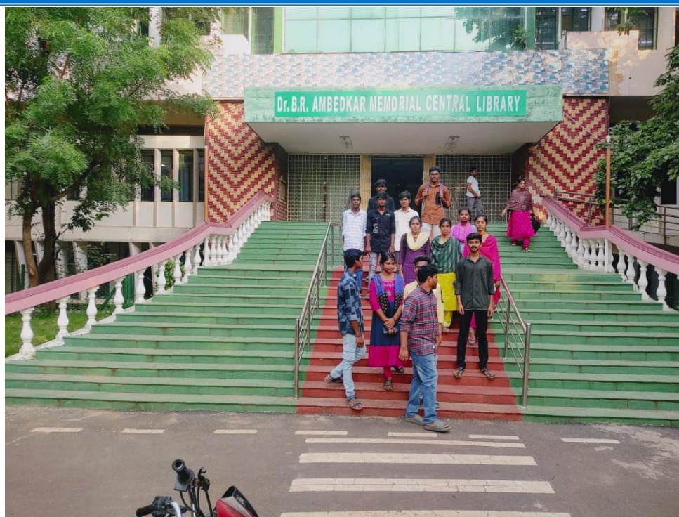
Central library in the campus