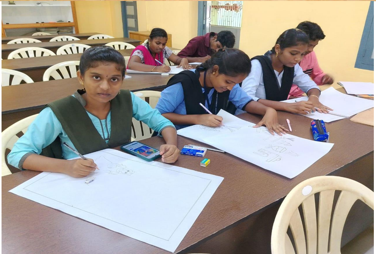
Students in Competitions