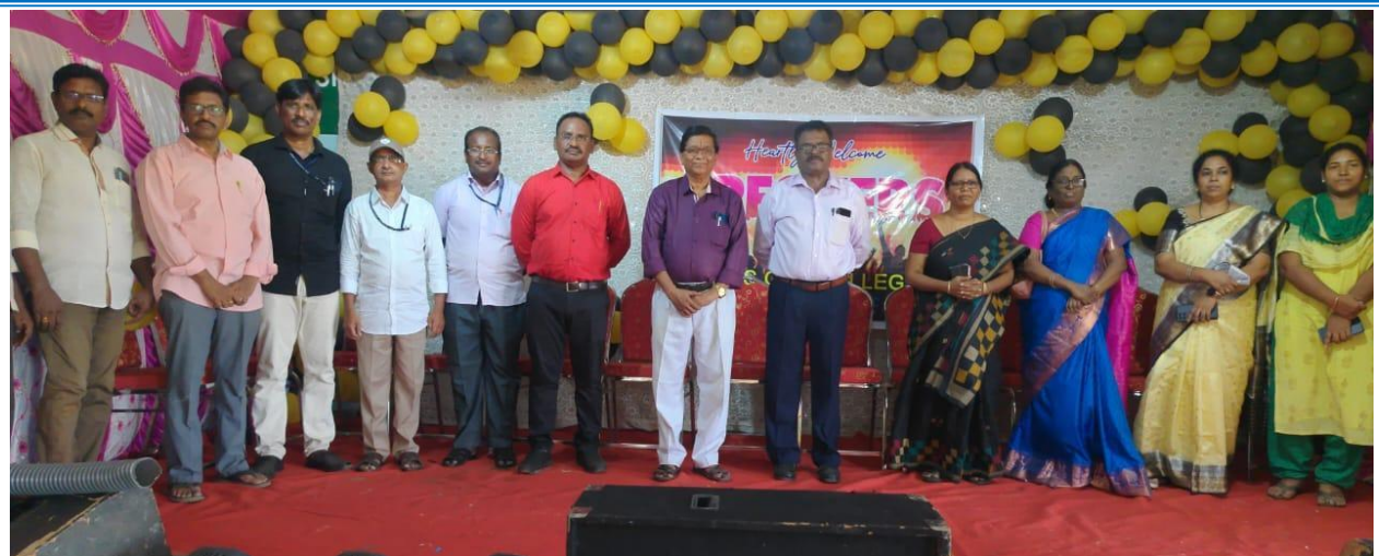
Staff in the event